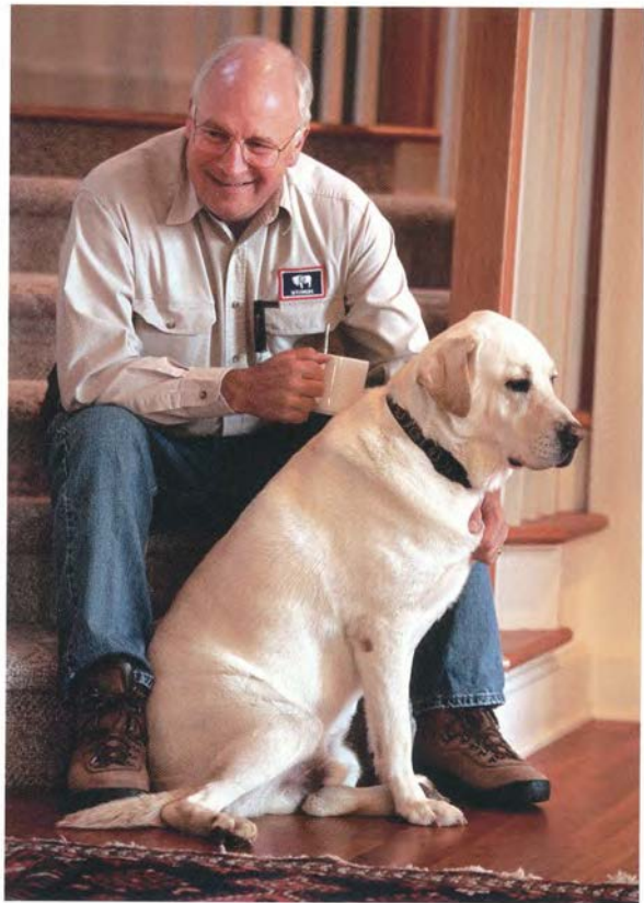
VICE PRESIDENT DICK CHENEY