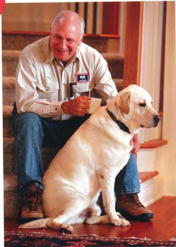
VICE PRESIDENT DICK CHENEY