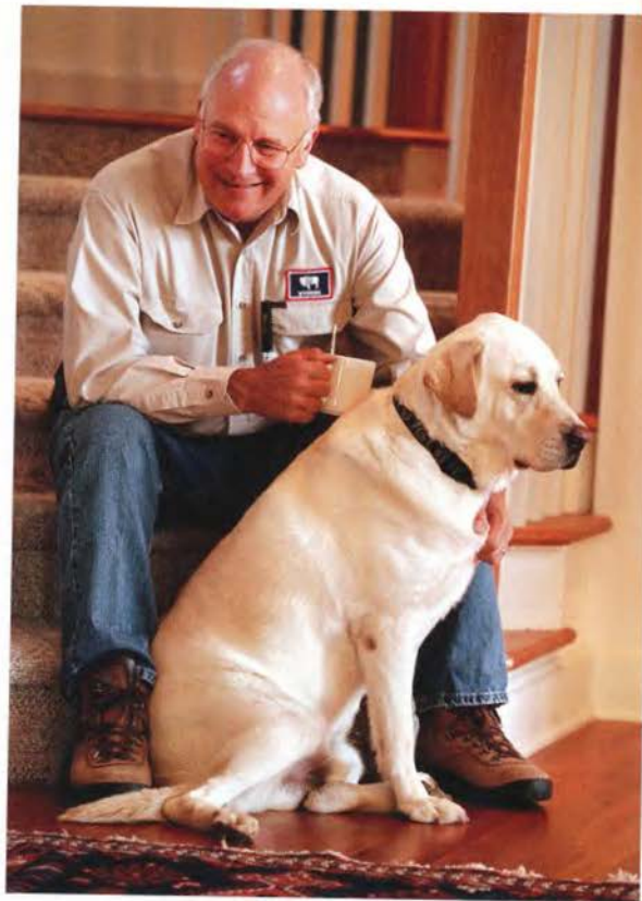
VICE PRESIDENT DICK CHENEY