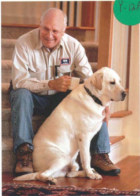
VICE PRESIDENT DICK CHENEY